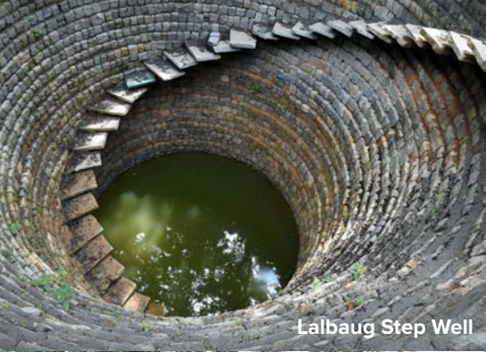
Lalbaug Step Well